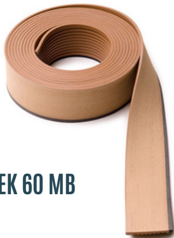
ISITEEK 60 MB

The 60 MW is 60mm wide, comprising a 55mm plank and a 5mm caulk line.