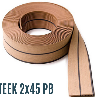
ISITEEK 2x45 PB

The profile itself is 90mm wide, composed of two 40mm planks separated by 5mm caulk lines.