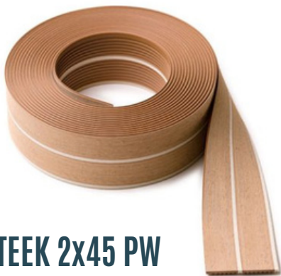
ISITEEK 2x45 PW