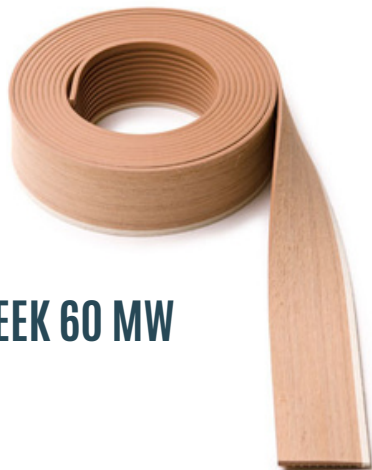
ISITEEK 60 MW